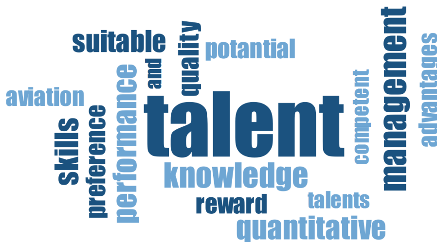
FIGURE 2: Word Cloud

When the interviews in Table 2 were evaluated with code-based frequency analysis, remarkable situations were experienced in the general distribution over 6 codes. While 100% of the executives talked about qualification, suitability, field knowledge, performance, 90% productivity and effectiveness, and talent pool, they showed again with a high rate.